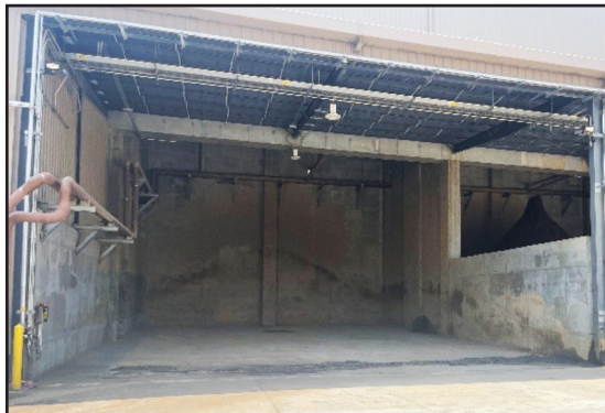
Bays with cracking on walls before repairs.

Repeated freeze/thaw cycles led to expansive cracking of the concrete walls and subsequent leakage between bays.