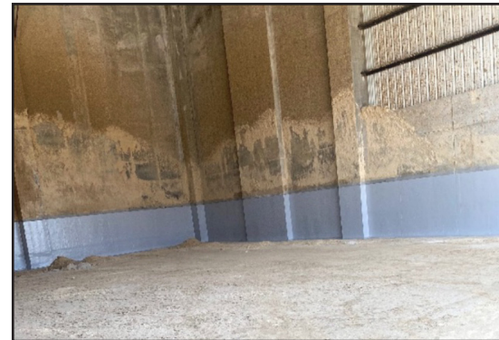
After ARC 797 and tape repairs were completed, all surfaces received two 10 – 12 mils coats of ARC CS2.

Leaks between bays have been greatly reduced and the slipping issues have been improved.