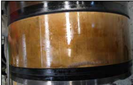
Worn, scored piston bushing.

The existing bronze bushings of the pistons and rods were worn by excessive lateral load on the cylinders and by the high number of press cycles. The radial movement caused mechanical damage of the hydraulic seals on the pistons and rods, leading to malfunctioning of the press cylinders.