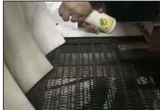
Chesterton 650 AML is sprayed on the chains in the high-temperature tunnel inside the shrink wrapper.

650 AML is a biodegradable, NSF H1 certified, high performing lubricating oil, which is made from plant and synthetic based esters. It has extremely high load bearing capabilities and detergency to keep chains clean.