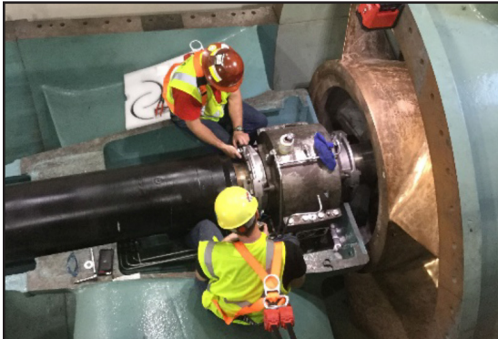
Refurbishing one of the pumps.